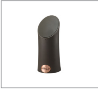
Model: CRISP 6